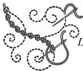
Double knot stitch

1. Work the outline first following by the filler stitches.